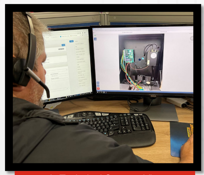
)∦( Technical Support View